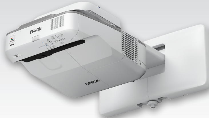
Optional wall mount not included.