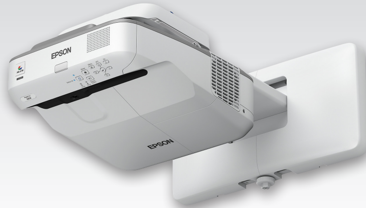
Optional wall mount not included.